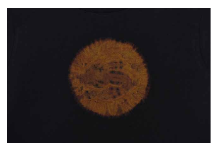
TA_0015 絞り Kids T-シャツ おつきさま Shibori T-shirts, moon