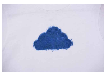
TA_0016 絞り Kids T-シャツ クラウド Shibori T-shirts, cloud