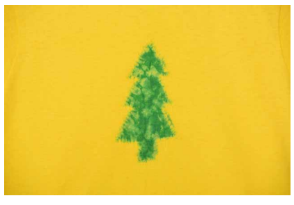
TA_0012 絞り Kids T-シャツ ツリー Shibori T-shirts, Tree