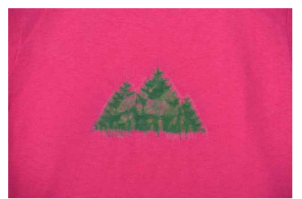
TA_0013 絞り Kids T-シャツ マウンテン Shibori T-shirts, mountain