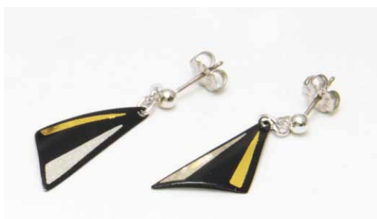
Stock No. NZ_0003 商品名 ピアス3(三角) Product Name piercings 3 (triangle)