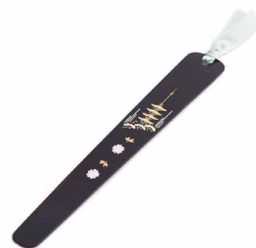
NZ_0034 しおりB (五重塔) Book mark with tower