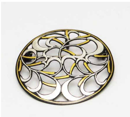
Stock No. NZ_0022 商品名 透かしペンダントブローチ [小] Product Name 22 Pendant brooch pattern