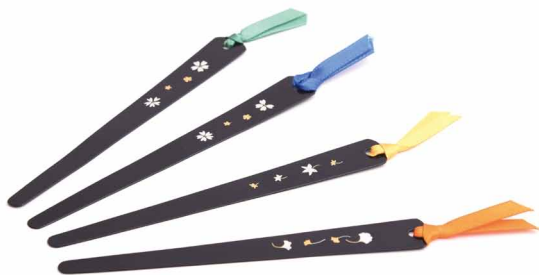
Stock No. NZ_0033 商品名 しおりA Product Name Book mark