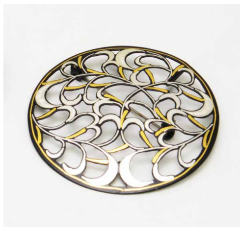
NZ_0024 透かしペンダントブローチ [大] 24 Pendant brooch [L]