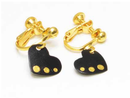
Stock No. NZ_0001 商品名 ピアス1(ハート) Product Name piercings 1 (heart)