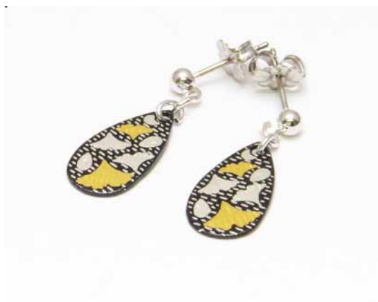
Stock No. NZ_0005 商品名 ピアス5(雫) Product Name piercings 5 (drop)