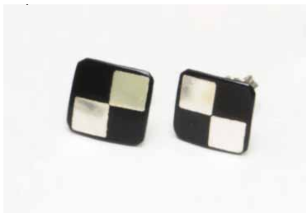
Stock No. NZ_0006 商品名 ピアス6(四角/ブロック) Product Name piercings 6 (square)