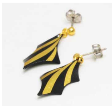
Stock No. NZ_0004 商品名 ピアス4(しましま) Product Name piercing 4 (stripe)