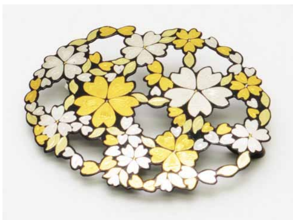
Stock No. NZ_0023 商品名 透かしペンダントブローチ [花] Product Name 23 Pendant brooch (flower)