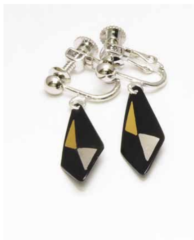
Stock No. NZ_0002 商品名 イヤリング(菱形/ブロック) Product Name Earrings (diamond)