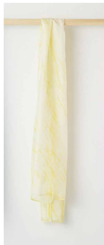
Stock No. BS_0008 商品名 KIZOME UMIスカーフ大判 イエロー Product Name KIZOME -UMI scarf yellow