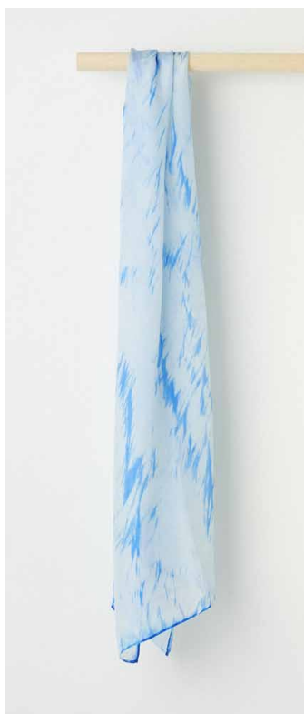
Stock No. BS_0006 商品名 KIZOME UMIスカーフ大判 青 Product Name KIZOME -UMI scarf blue