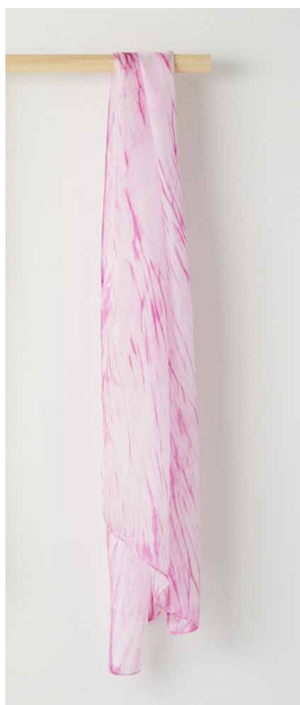
Stock No. BS_0007 商品名 KIZOME UMIスカーフ大判 ピンク Product Name KIZOME -UMI scarf pink